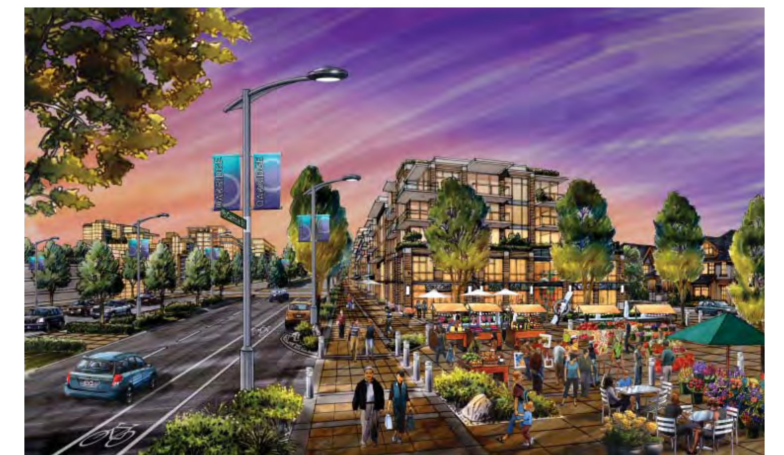
Idea: Oakridge Town Centre Plaza, Night (Artist Interpretation)