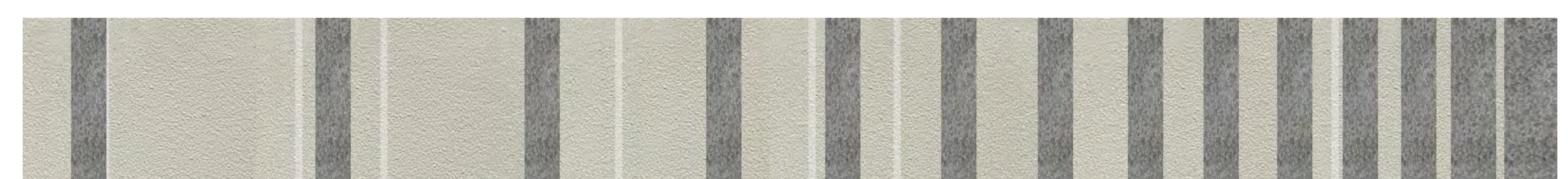
Basalt pattern intensity