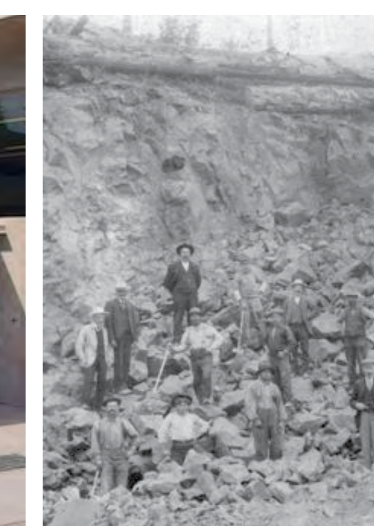
Queen Elizabeth Park Basalt Quarry