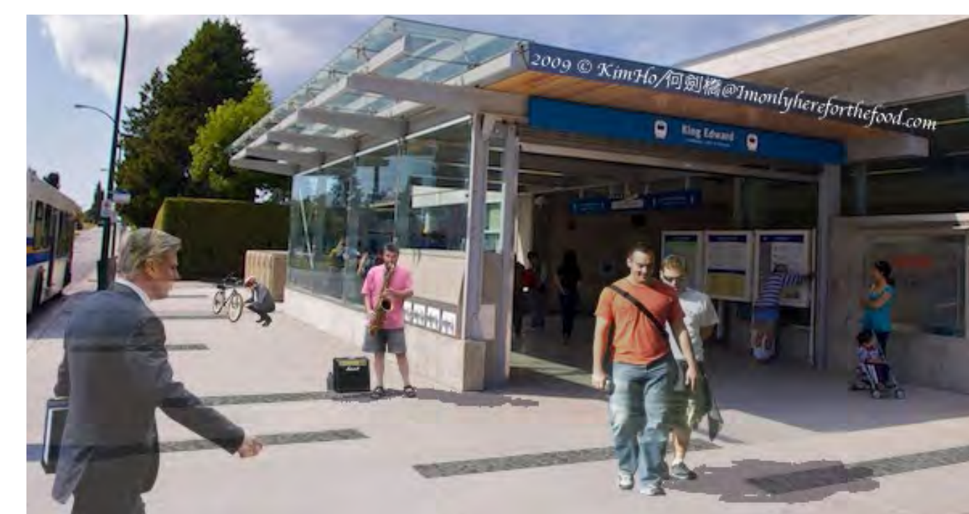
Idea: King Edward Station -After, Proposed Addition of Basalt Inserts, Station Entrance