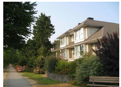
Weinberg Residence at western end of site

Note: Unique site profiles are intended to provide a general snapshot of policies and Vision directions as background for discussion. Please see actual policy, zoning, and Vision documents for full information.