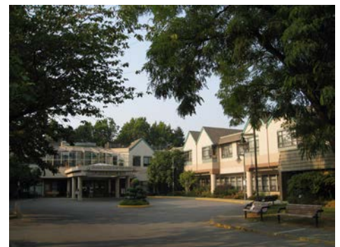
Louis Brier Home and Hospital